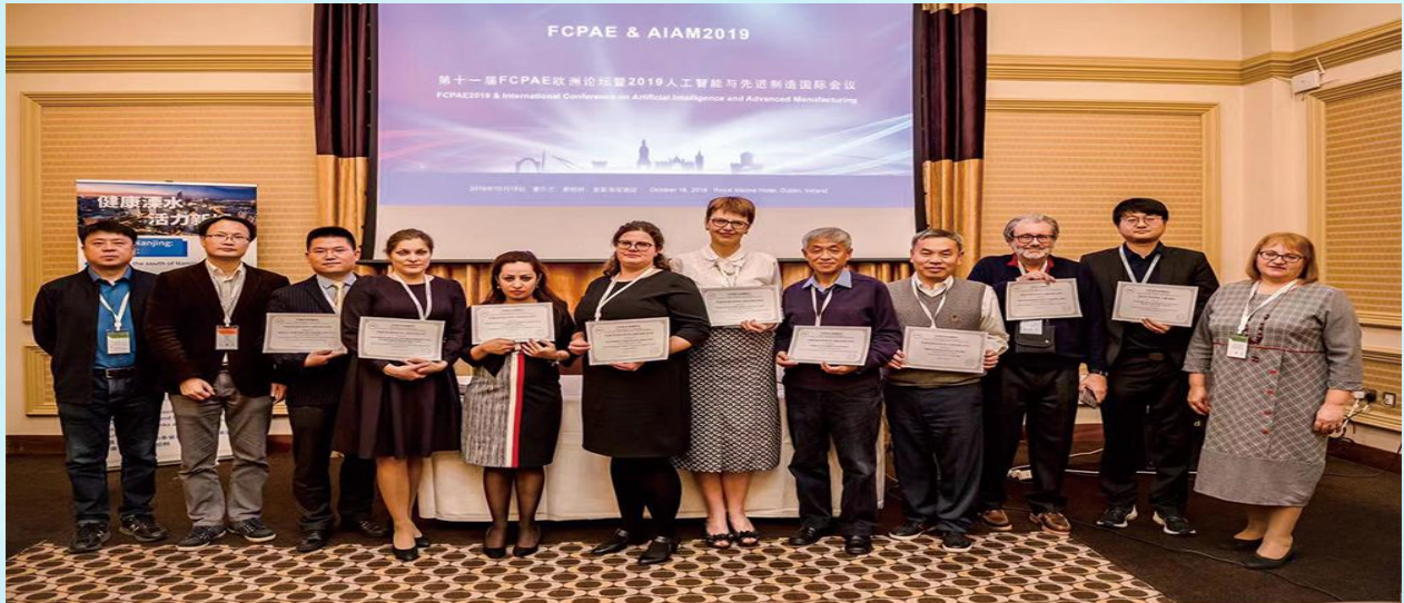
第十一届FCPAE欧洲论坛暨2019人工智能与先进制造国际会议 FCPAE2019 & International Conference on Artificial Intelligence and Advanced Manufacturing 爱尔兰·都柏林 2019-10-18

国际应用科学与技术协会(International Association of Applied Science and Technology, IAAST)于2010年在香港注册成立,通过组织国际会议、论坛、研讨会等活动,为来自全球的专家、学者提供一个交流最新学术成果、建立科研合作的机会与平台。十年来,IAAST深耕科研服务领域,成功组织国际会议100余场,涉及机械、生物医学、管理制造、材料工程、计算机、能源、环境等多个领域;邀请国内外权威专家500余人,累计参会人数近万人,累计完成万余篇学术论文的顺利发表。