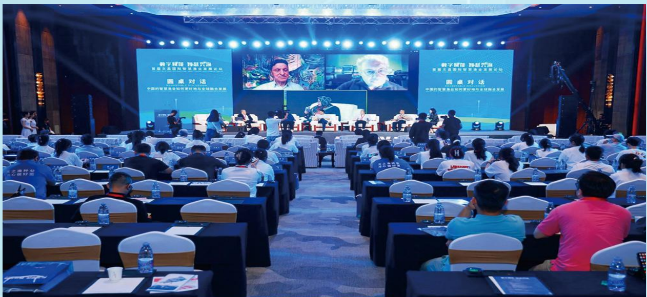
首届文昌国际智慧渔业发展论坛 First Wenchang International Smart Fishery Development Forum 中国·海南 2023-03-26